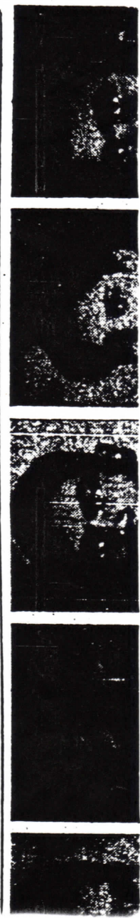
BROOKLYN, Oct. 27—The housing situation of Brooklyn Negroes