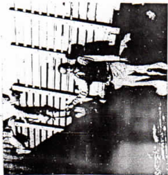
Federal government agencies are settling all its belongings piled upon the porch and a notice that it must vacate by morning to make room for a white family. Bottom center: The type of house being built in Transylvania for white farmers. Top center: A Negro farmer, former Transylvania resident, with all of his belongings, going to some new place. All of his household goods have been thrown into a truck. Right: This farmer had to move his corn. When he reached the new place, he found there was no barn, so he had to keep his corn in his kitchen.